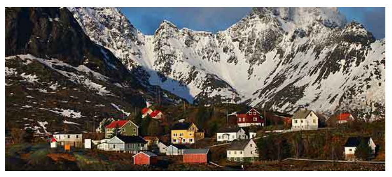
Fishing Village on Island of Moskenes on Lofoten Islands, Norway.